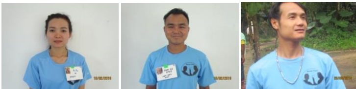
Saw Day Po